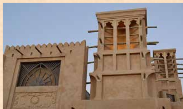
Windtowers made of Sea Stone, Coral Sand and Mud