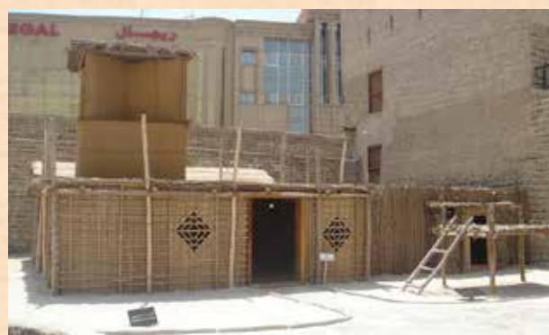
Al Areesh with Barjeel, Dubai Museum

A wind tower or Barjeel is the traditional architecture found throughout the Arabian Gulf, in particular Dubai & Bahrain, and also throughout Persia, parts of Pakistan and Afghanistan. Its origins go as far back as Ancient Egypt, with examples of wind tower construction dating back to 3100BC. In arid climates the wind tower acts as a ventilation system allowing hot air to rise out the top of it, and cooler directed winds to flow down into the home. Wind tower houses along the Dubai Creek were constructed of palm fronds known as Bait Areesh and were mostly used pre-1900's, as well as the Coral or Sea Stone called Bait Morjan which date back to the late 1800's.